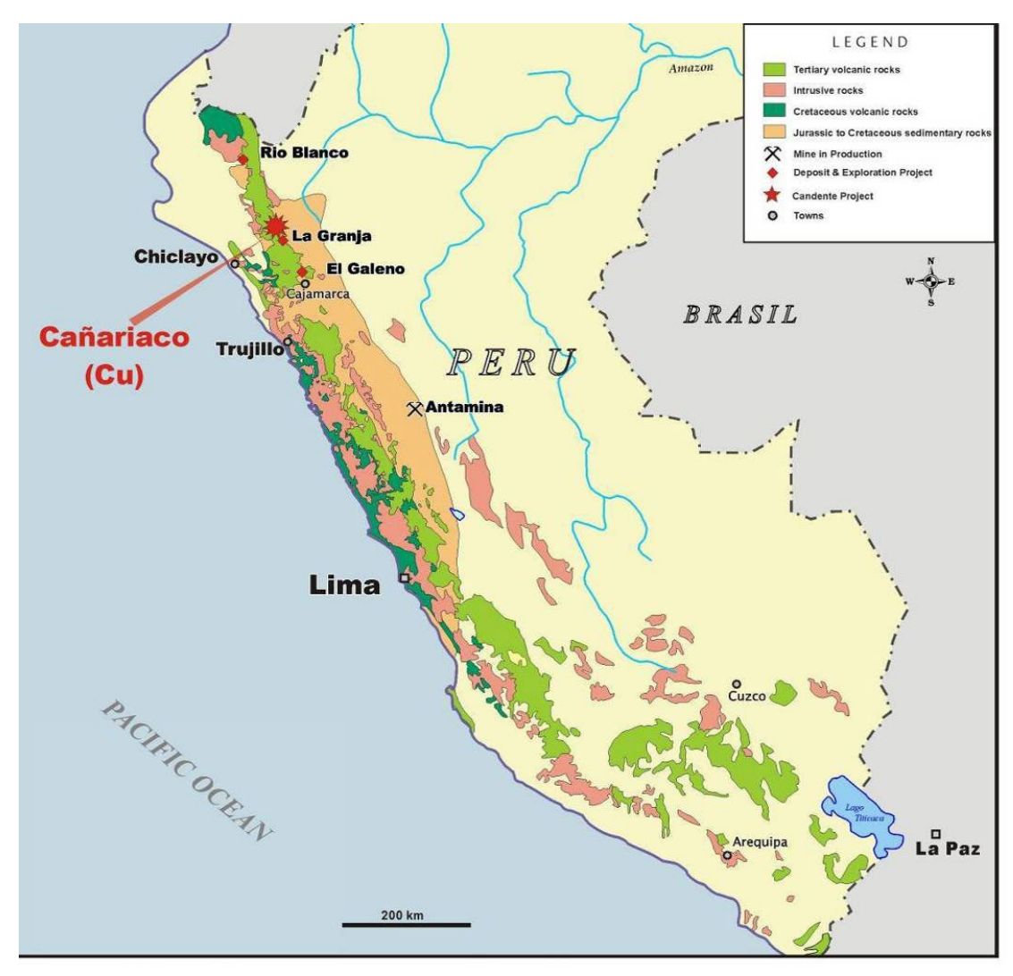
MINERAL TENURE, SURFACE RIGHTS, AND ROYALTIES

The Cañariaco Copper Project consists of 5 Cañariaco concessions, covering a total area of 4,289.50 hectares.