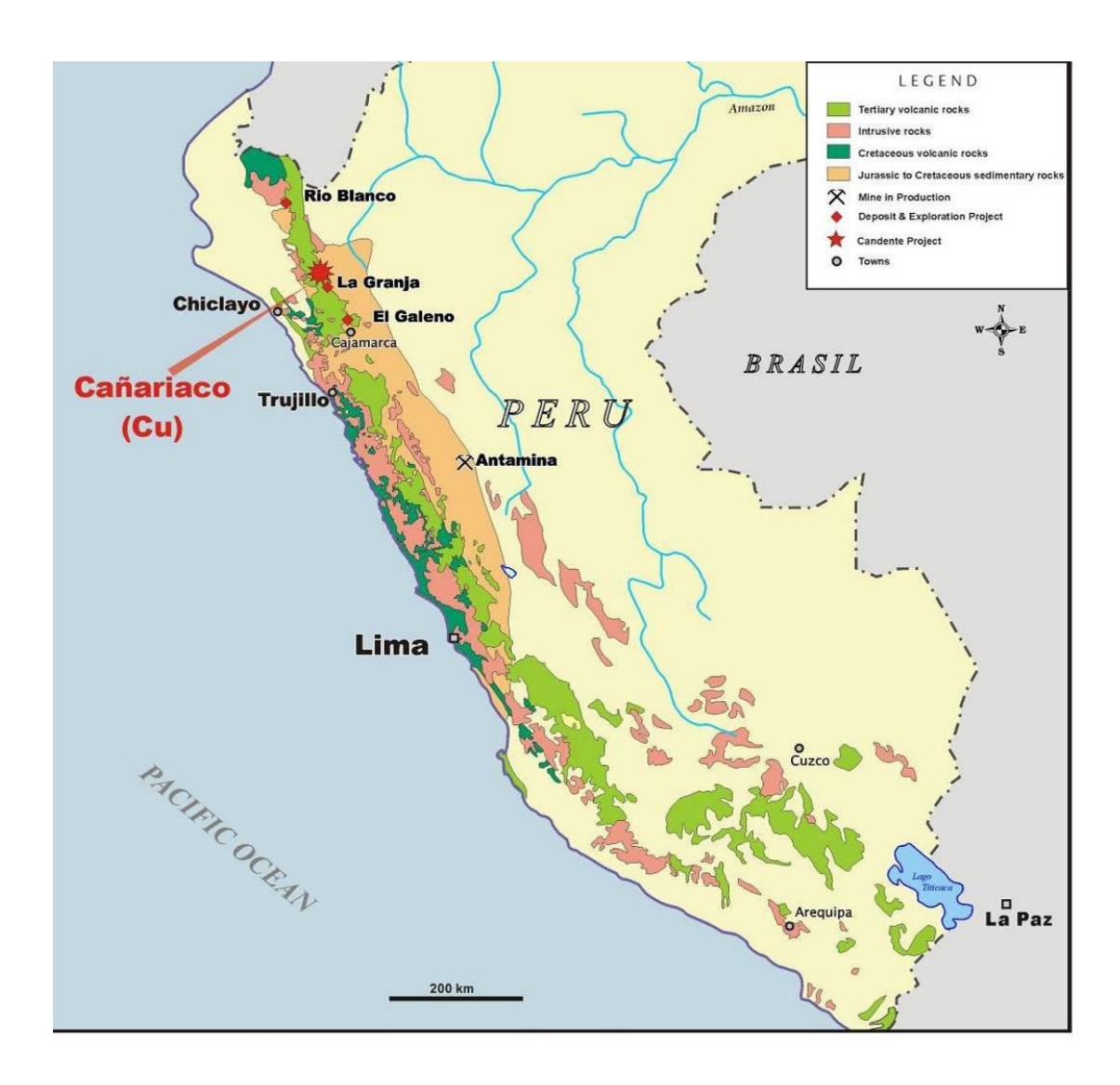
MINERAL TENURE, SURFACE RIGHTS, AND ROYALTIES

The Cañariaco Copper Project consists of 5 Cañariaco concessions, covering a total area of 4,289.50 hectares.